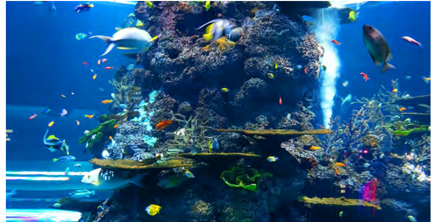
The 20,000 leagues in the title of the book refers to the horizontal distance of travel. It is roughly the distance as traveling around the earth twice.

The underwater paradise becomes a nightmare as Nemo